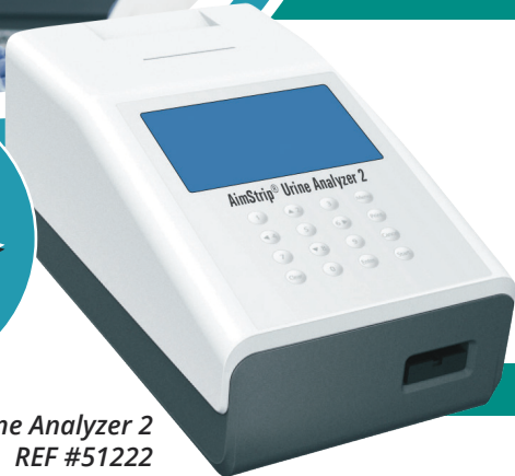
AimStrip® Urine Analyzer 2 REF #51222

AimStrip® Urine Analyzer 2 is for the semi-quantitative detection of the following analytes in urine: Glucose, Bilirubin, Ketone (Acetoacetic acid), Specific Gravity, Blood, pH, Protein, Urobilinogen, and Leukocytes as well as the qualitative detection of Nitrite.